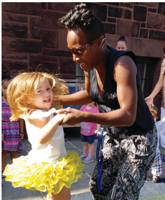
Celebrating World Jump Day at Luthercare for Kids – Lancaster

And the children participating in our summer camps at our Luthercare for Kids Early Learning Centers have had a blast taking part in camp weeks that focus on culinary arts, science, art and the outdoors! They've taken field trips to local art studios, bakeries and more to learn from the experts and get some hands-on experience. The centers have also celebrated special days, such as International Mud Day in June and World Jump Day in July, allowing associated activities to be teachable moments and promoting physical activity and a sense of community all the same time!