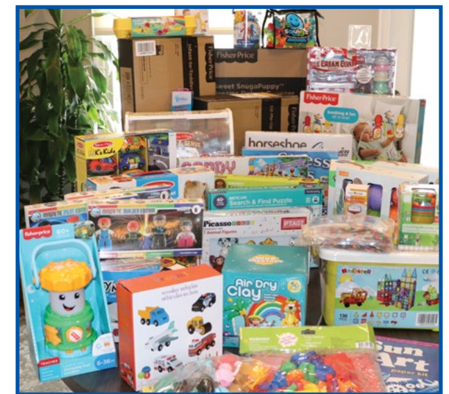
Shown here are some of the gifts purchased by generous donors from last year's "Christmas Wish List."

If you would like to make a contribution toward purchasing Christmas presents for the kids, you can send a check to the Philanthropy Office made out to Luthercare with "Wish List" written on the memo line. In order to get these presents to the children in time for Christmas, please have all gifts or contributions sent in by Friday, December 10.